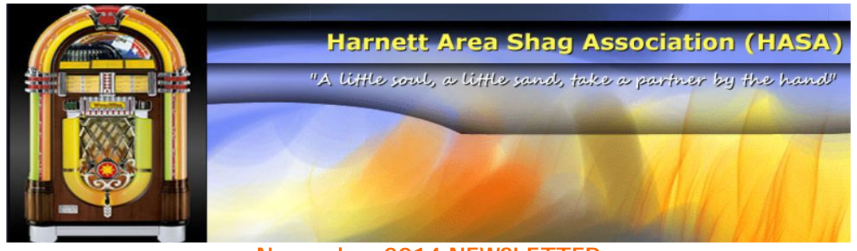
November 2014 NEWSLETTER