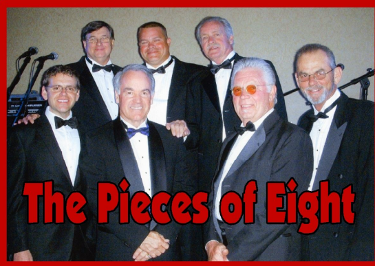
The Pieces of Eight